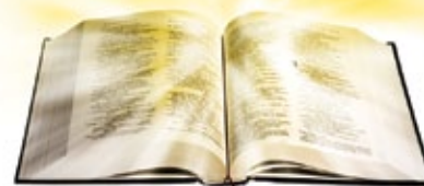
God's Word exposes Satan's strategies.

Answer: God always counters Satan's lies with Bible truth. When tempted by Satan in the wilderness, Jesus repeatedly quoted Scripture (Matthew 4:1-11). Through His remnant people, God will tell the truth about the unbiblical nature of Babylon the great. He will make it clear that Babylon is presenting a false gospel (Galatians 1:8-12) which has opened the door wide for billions