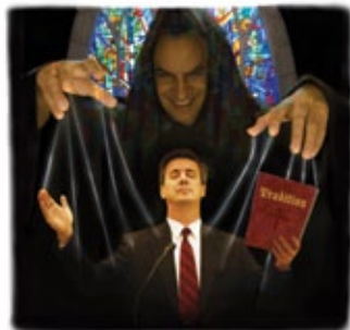
In the end time, Satan will deceive all who do not demand clear Scripture proof for every Bible doctrine.

Answer: Though Satan hates God and His Son, he rarely admits it openly. In fact, he and his demons will pose as holy angels and as devoted Christian clergymen (2 Corinthians 11:13-15). What he presents as evidence for his side will seem so righteous, spiritual, and Jesus-like that nearly everybody on earth will be deceived and follow him (Matthew 24:24). He will doubtless use the Bible, as he did when tempting Jesus in the wilderness (Matthew 4:1-11). Satan's logic is so persuasive that it deceived one-third of the angels of heaven, Adam and Eve, and (at the time of the Flood) everybody on earth except eight people.