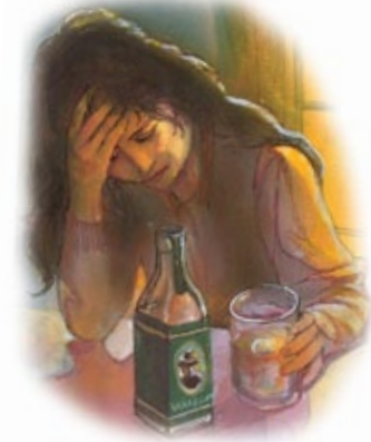
Receiving false doctrine brings spiritual drunkenness, which makes comprehending truth extremely difficult.