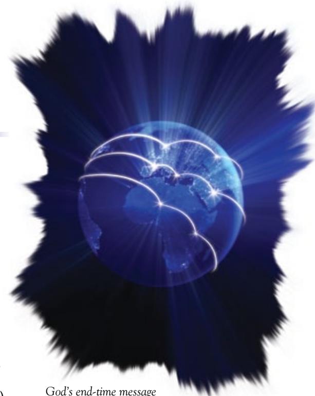
God's end-time message will bring glorious truth and light to every person on earth.

Answer: In Scripture, angels represent messengers or messages (Hebrews 1:13, 14). God's end-time appeal is symbolized by a mighty angel whose power is so great that the entire world is lightened with God's truth and glory. This final, God-given message will go to the inhabitants of the entire world (Revelation 14:6; Mark 16:15; Matthew 24:14).