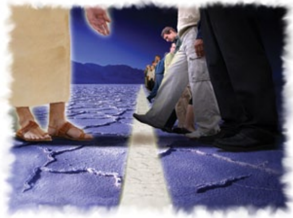
When Jesus' end-time appeal is given to all the world, His true people will come out of Babylon and follow Him.

Please notice that Jesus refers to many people in Babylon as “my people.” There are millions of sincere Christians in Babylon who have not yet heard this urgent warning message. These people love the Lord supremely, and Jesus says they are His children.