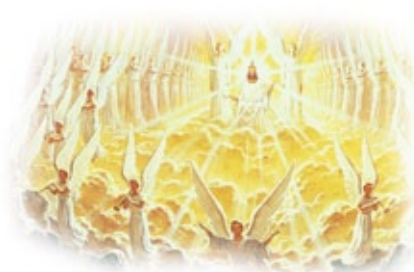
The angels of heaven will be on the side of God's people in earth's final battle.

Answer: In this final battle, the angels of heaven (Hebrews 1:13, 14; Matthew 13:41, 42) and God's people—the remnant (Revelation 12:17)—will be allied with Jesus, who leads the armies of heaven (Revelation 19:11-16) against Satan and his supporters.