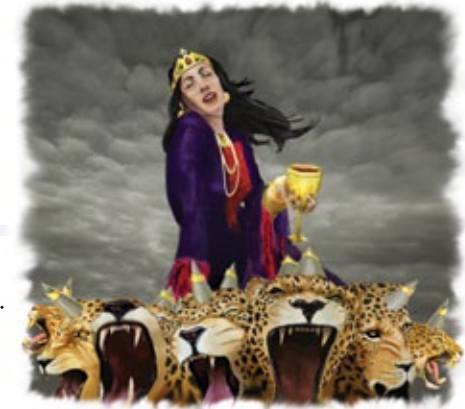
The beast of Revelation 17 represents the civil government. The woman astride the beast means that the church is in control of the government.

Answer: In Revelation 13:1-10, Jesus portrays the papacy as a combination of church and state. (For more information, see Study Guide 20.) In Revelation chapter 17, Jesus depicts the church (the harlot) and state (the beast) as separate entities, though related. The woman is astride the beast, which signifies that the church is in control of the state.