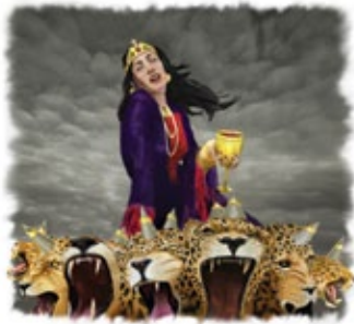
In the book of Revelation, God calls this woman "Babylon."