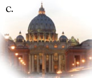
Non-Christian religions and apostate Protestantism will join the papacy as allies in the final war against God and His followers.