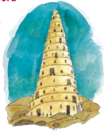
The word “Babylon” dates back to the Tower of Babel. It means “confusion.”

Answer: The words “Babel” and “Babylon” mean “confusion.” The name Babylon originated at the Tower of Babel, which was erected after the Flood by defiant pagans who hoped to build it so high that no floodwaters could ever cover it (verse 4). But the Lord confounded their language, and the resultant confusion was so great they were forced to halt construction. They then called the tower “Babel” (Babylon), or “confusion.” Later, in Old Testament days, a worldwide pagan kingdom named Babylon arose which was an enemy of God’s people, Israel. It embodied rebellion, disobedience, persecution of God’s people, pride, and idolatry (Jeremiah 39:6, 7; 50:29, 31-33; 51:24, 34, 47; Daniel chapters 3 and 5). In fact, in Isaiah chapter 14 God uses Babylon as a symbol of Satan himself because Babylon was so hostile and devastating to God’s work and His people. In the New Testament book of Revelation, the term “Babylon” is used to signify a religious kingdom that is an enemy of God’s spiritual Israel—His church (Revelation 14:8; 16:19).