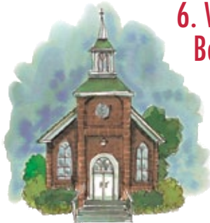
Churches that adopt the false teachings of mother Babylon become “Babylon” themselves.

Answer: They are some of the churches which originally protested the false teachings of mother Babylon and left her during the great Protestant Reformation. But, later, they began to mimic the principles and actions of the mother and thus became fallen themselves. No woman is born a harlot. Neither were the symbolic Protestant daughter churches born fallen. Any church or organization that teaches and follows Babylon’s false doctrines and practices could become a fallen church or daughter. So Babylon is a family name which embraces both the mother church and those of her daughters, who are also fallen.