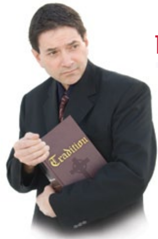
Babylon falls because she turns away from Bible truth.