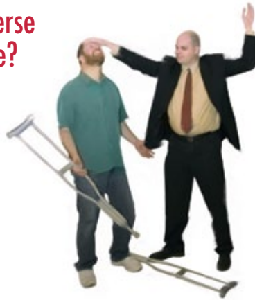
The powerful miracles of Satan and his angels (posing as spirits of the dead) will unite the world in their support of the beast.