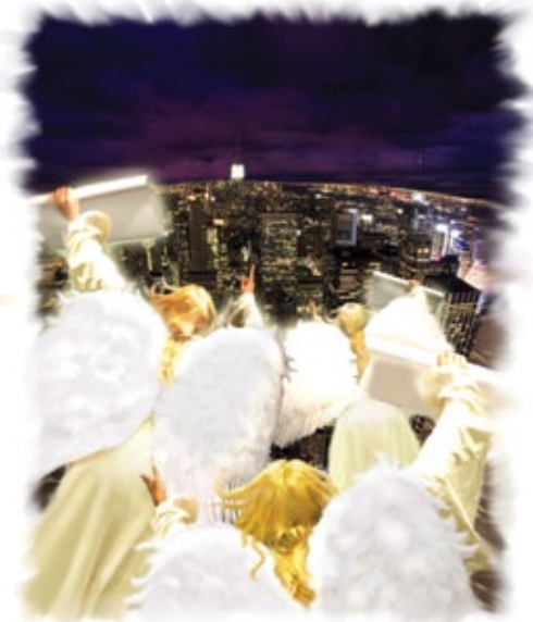
God uses angels to symbolize His final three-point message.

Answer: The word "angel" literally means "messenger," so it is fitting that God uses three angels to symbolize the preaching of His three-point gospel message for the last days. God uses the symbolism of angels to remind us that supernatural power will accompany the messages.