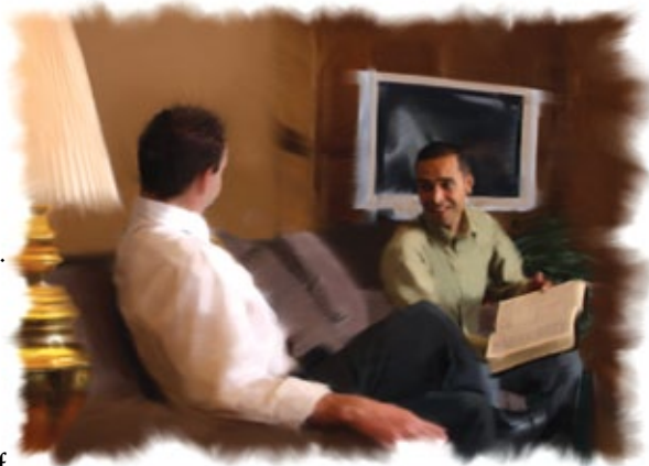
The Lord’s end-time saints will find their greatest happiness in pleasing Him.