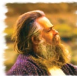
The special emphasis of Noah’s “present truth” was a coming flood.

(Genesis 6 and 7; 2 Peter 2:5). Noah was a preacher of righteousness. He taught God’s love as he warned of a coming flood that would destroy