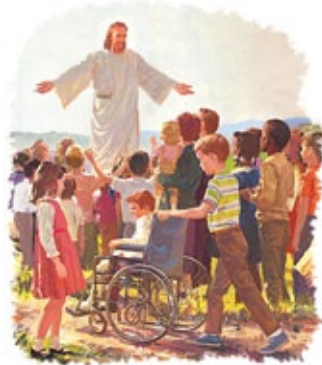
The book of Revelation reveals Jesus in a unique manner.

Note: Before proceeding further, please open your Bible and read Revelation 14:6-14.