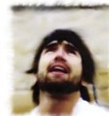
John the Baptist’s “present truth” was that the Messiah would soon appear.

(Revelation 14:6-14). God’s “present truth” for today is contained in the three angels’ messages. Of course, salvation through Jesus Christ alone is central to these messages. However, the “present truth” of the three angels also has been given to prepare people for Jesus’ second coming and to open their eyes to Satan’s brilliant and highly convincing deceptions. Unless people understand these messages, Satan will indeed capture and destroy them. Jesus knew we needed these three special messages, so in loving kindness He has given them. They must not be omitted. Please pray earnestly as you examine them point by point in the next eight Study Guides. Some of your discoveries may be almost shocking. But all will be satisfying. Your heart will be tremendously stirred. You will sense Jesus speaking to you! After all, they are His messages.