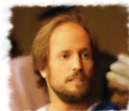
Jonah’s “present truth” was that Nineveh was to be destroyed in 40 days.

city repented. To omit, however, the 40-day warning would have been unfaithful and unforgivable. It was present truth. It fitted that time in a special way.