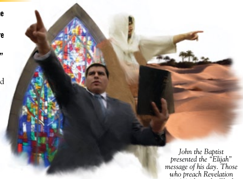
John the Baptist presented the “Elijah” message of his day. Those who preach Revelation 14:6-14 have the Elijah message for today.

The Bible says of John the Baptist, “He will go... in the spirit and power of Elijah” (Luke 1:17).