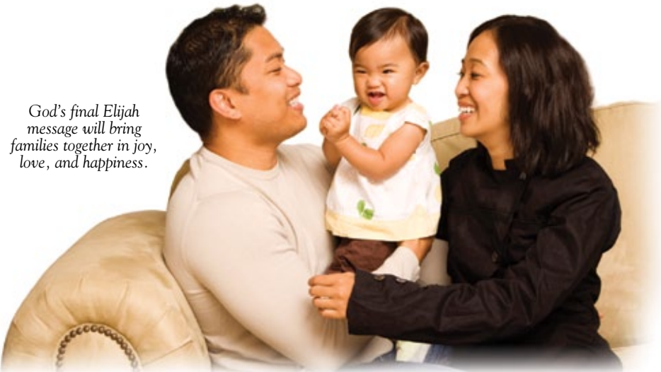
God's final Elijah message will bring families together in joy, love, and happiness.

Elijah insisted evil be met head-on and that all decide whom they would serve. So it is with God's threefold message for us today. A decision must be made. God's threefold message unmasks Satan and his plans. It clearly reveals God's love and His requirements. God is calling people today back to true worship—worship of God alone. To knowingly serve and worship anyone or anything else in this crucial day amounts to disloyalty and will result in eternal death. God miraculously reached hearts in Elijah's day (1 Kings 18:37, 39) and in the days of John the Baptist. He will do the same in these last days as people respond to the three angels' messages (Revelation 18:1).