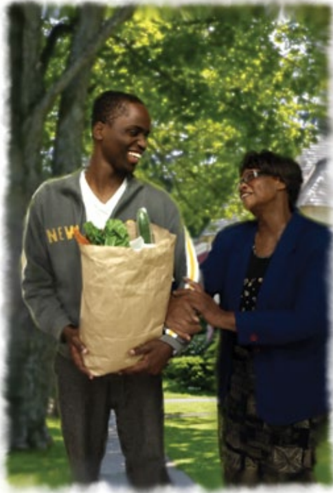
Those who revere God will find pure joy in serving Him.

Redeemer. (Many books and radio talk shows today overstress self-esteem, which leads to self-worship. A Christian's self-esteem is in Christ, who makes His children sons and daughters of the King of heaven.) The gospel includes the creation and redemption of the world by the Lord God of heaven. Worshiping the Creator includes worshiping Him on the day He set aside as a memorial of Creation (the seventh-day Sabbath). That the reference in Revelation 14:7 is to the Sabbath is made clear by the fact that the words "made the heavens and the earth, the sea" were lifted right out of the Sabbath commandment (Exodus 20:11) and used here. (See Study Guide 7 for more information on the Sabbath.) Our true roots are found in God alone, who made us in His image in the beginning. Those who do not worship God as Creator—no matter what else they may worship—may never discover their real roots.