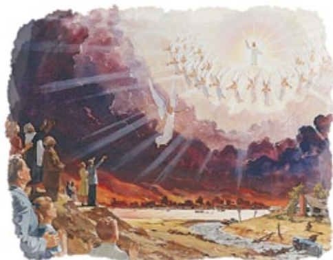
When all have heard Jesus’ end-time message, He will return to earth to take His people with Him to heaven.

“Then I looked, and behold, a white cloud, and on the cloud sat One like the Son of Man, having on His head a golden crown” (Revelation 14:14).