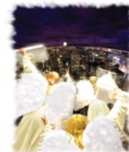
The three angels’ messages are God’s present truth for today.