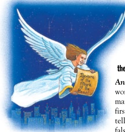
Those who worship the beast and receive his mark will be destroyed by God.

Answer: The third angel's message warns people against worshiping the beast and his image and receiving the mark of the beast in their foreheads or hands. The first angel commands true worship. The third angel tells of the awesome consequences connected with false worship. Do you know for certain who the beast is? And what is his mark? Unless you know positively who the beast is and what his mark is, you may end up worshiping him without realizing it. (Study Guide 20 provides full details regarding the beast and his mark. Study Guide 21 explains his image.)