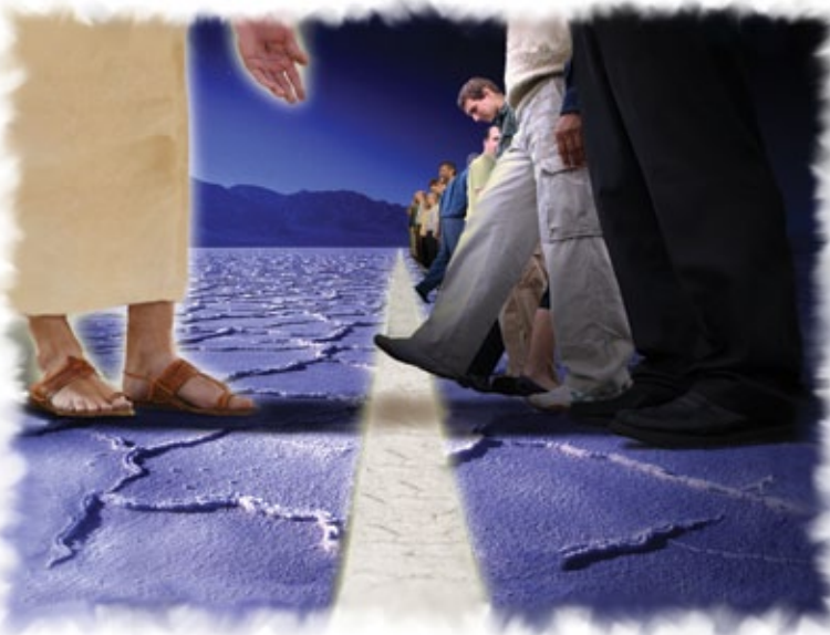
God’s end-time messages are also called the “Elijah” message. They call for a decision.

Note: Please open your Bible and carefully read 1 Kings 18:17-40 before answering this question.