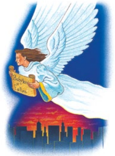
God's people must come out of Babylon.

Answer: The second angel solemnly states that "Babylon is fallen," and the voice from heaven urges all of God's people to come out of Babylon at once. Unless you know what Babylon is, you could easily end up in it. Think about it. Could you possibly be in Babylon now? (Study Guide 20 gives a clear presentation of Babylon.)