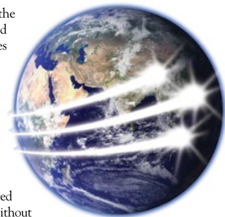
God's end-time message of hope must be delivered to every person on earth.

Satan's counterfeits, while many, include two very effective ones: (1) salvation by works, and (2) salvation in sin. These two counterfeits are uncovered and revealed in the three angels' messages. Many, without realizing it, have embraced one of these two errors and are trying to build their salvation upon it—an utterly impossible feat. We also must stress that no one is truly preaching the gospel of Jesus for the end time who does not include the three angels' messages.